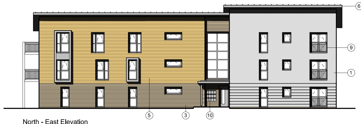
North - East Elevation

THIS DRAWING IS FOR PLANNING PURPOSES ONLY. IT IS NOT INTENDED TO BE USED FOR CONSTRUCTION PURPOSES. WHILST ALL REASONABLE EFFORTS ARE USED TO ENSURE DRAWINGS ARE ACCURATE, JOHN THOMPSON & PARTNERS ACCEPT NO RESPONSIBILITY OR LIABILITY FOR ANY RELIANCE PLACED ON, OR USE MADE OF, THIS PLAN BY ANYONE FOR PURPOSES OTHER THAN THOSE STATED ABOVE.