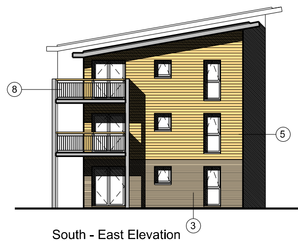
South - East Elevation