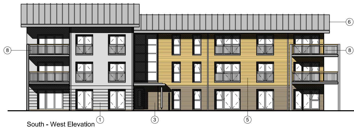
South - West Elevation