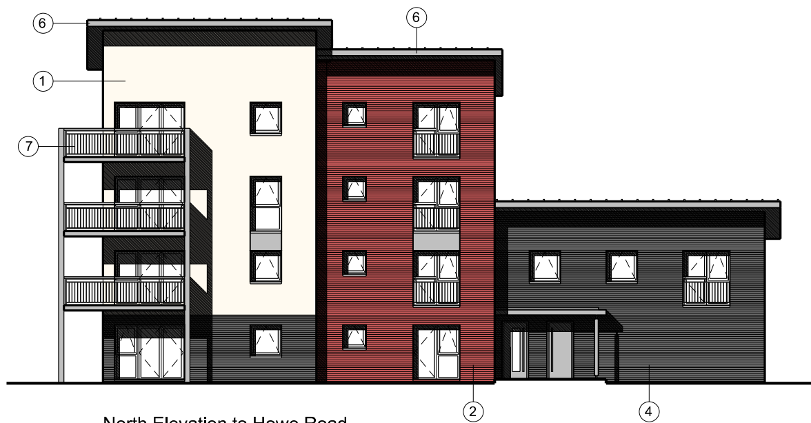
North Elevation to Howe Road