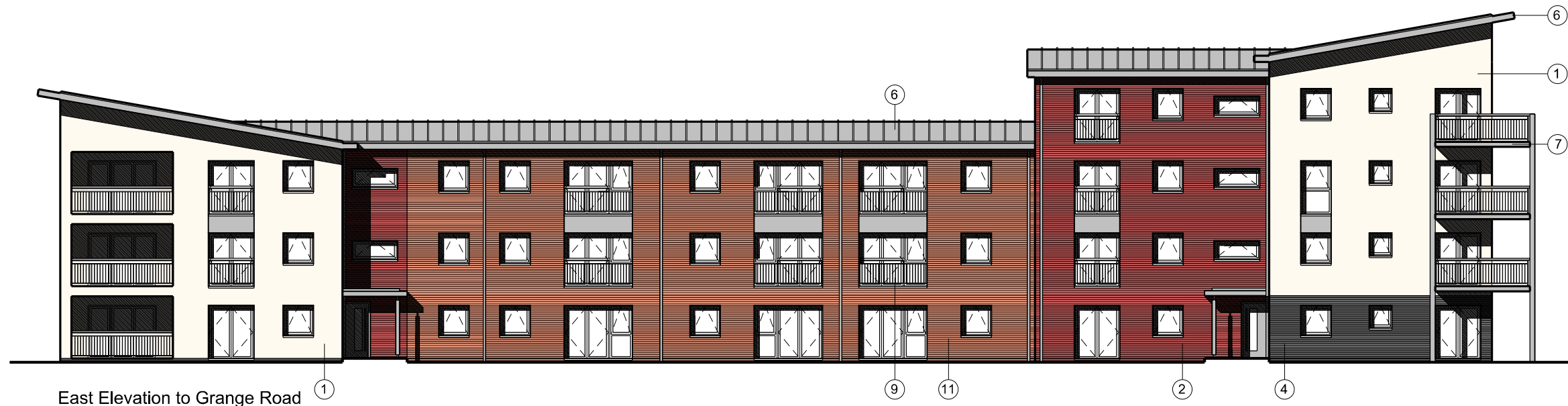
East Elevation to Grange Road

THIS DRAWING IS FOR PLANNING PURPOSES ONLY. IT IS NOT INTENDED TO BE USED FOR CONSTRUCTION PURPOSES. WHILST ALL REASONABLE EFFORTS ARE USED TO ENSURE DRAWINGS ARE ACCURATE, JOHN THOMPSON & PARTNERS ACCEPT NO RESPONSIBILITY OR LIABILITY FOR ANY RELIANCE PLACED ON, OR USE MADE OF, THIS PLAN BY ANYONE FOR PURPOSES OTHER THAN THOSE STATED ABOVE.