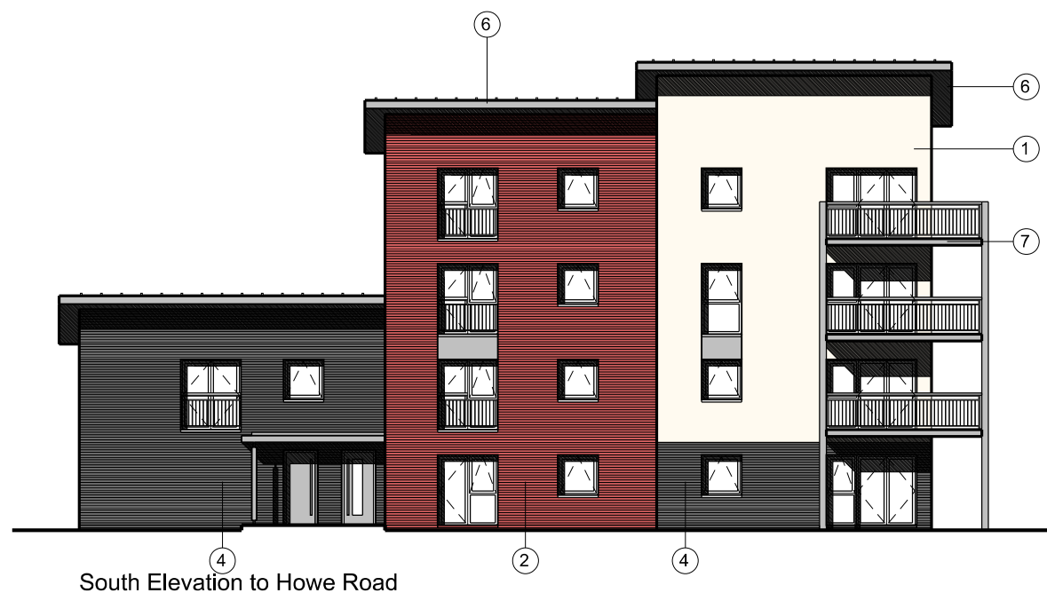
South Elevation to Howe Road