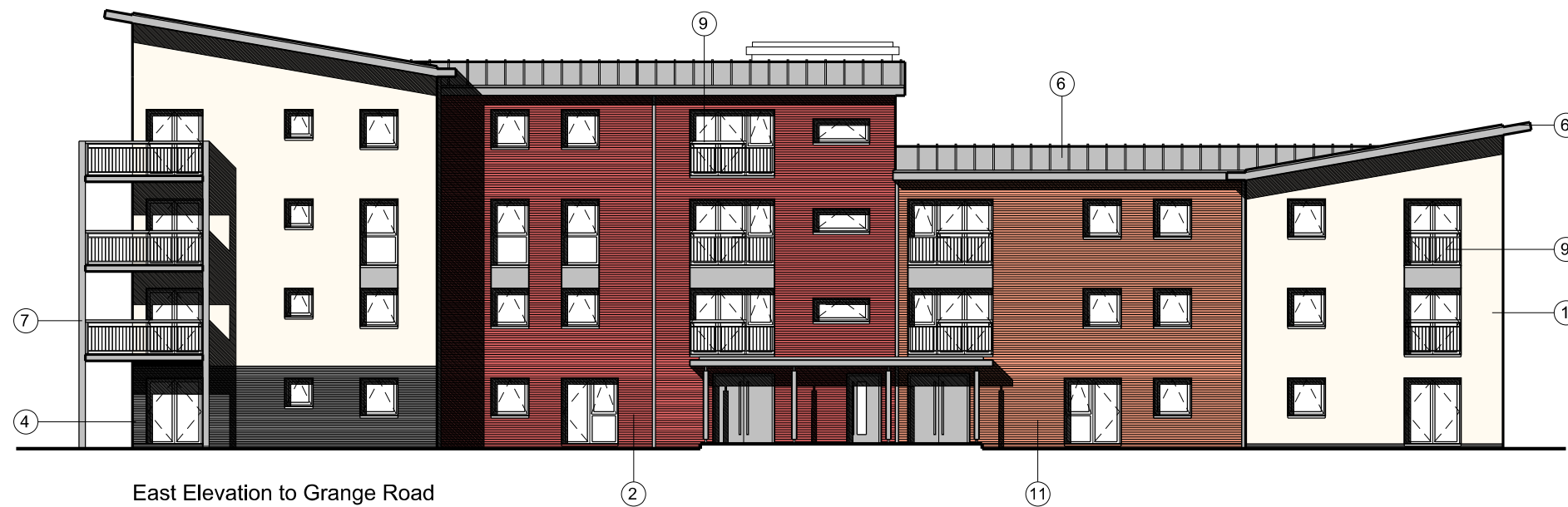
East Elevation to Grange Road

THIS DRAWING IS FOR PLANNING PURPOSES ONLY. IT IS NOT INTENDED TO BE USED FOR CONSTRUCTION PURPOSES. WHILST ALL REASONABLE EFFORTS ARE USED TO ENSURE DRAWINGS ARE ACCURATE, JOHN THOMPSON & PARTNERS ACCEPT NO RESPONSIBILITY OR LIABILITY FOR ANY RELIANCE PLACED ON, OR USE MADE OF, THIS PLAN BY ANYONE FOR PURPOSES OTHER THAN THOSE STATED ABOVE.