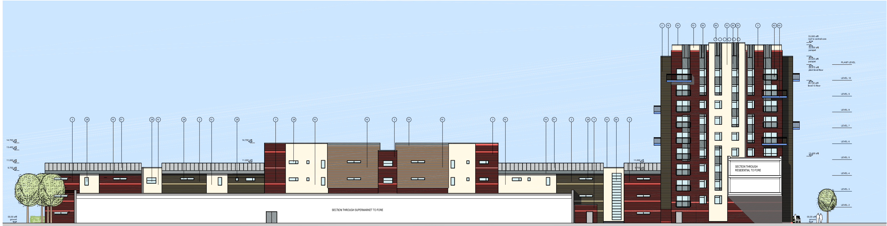
ELEVATION R4 : NORTH ELEVATION

Assessment Dates Drawing Revisions Reviewed by: